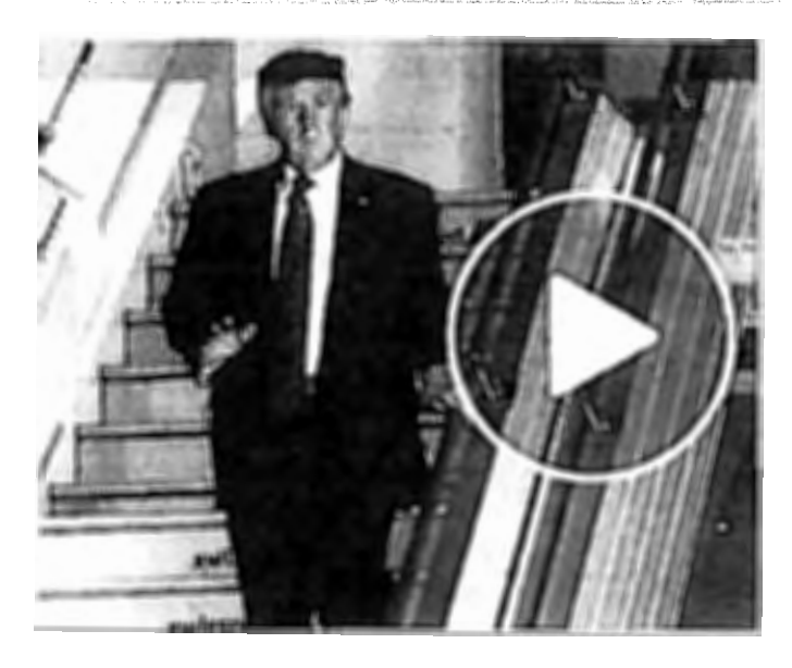
What Trump Knows That You Don't Something troubling is unfolding in America right before