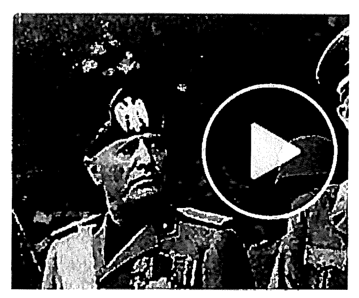
This Photo Changes Everything You Though Hitler

See the World War 2 discovery kept secret for over 70 ye